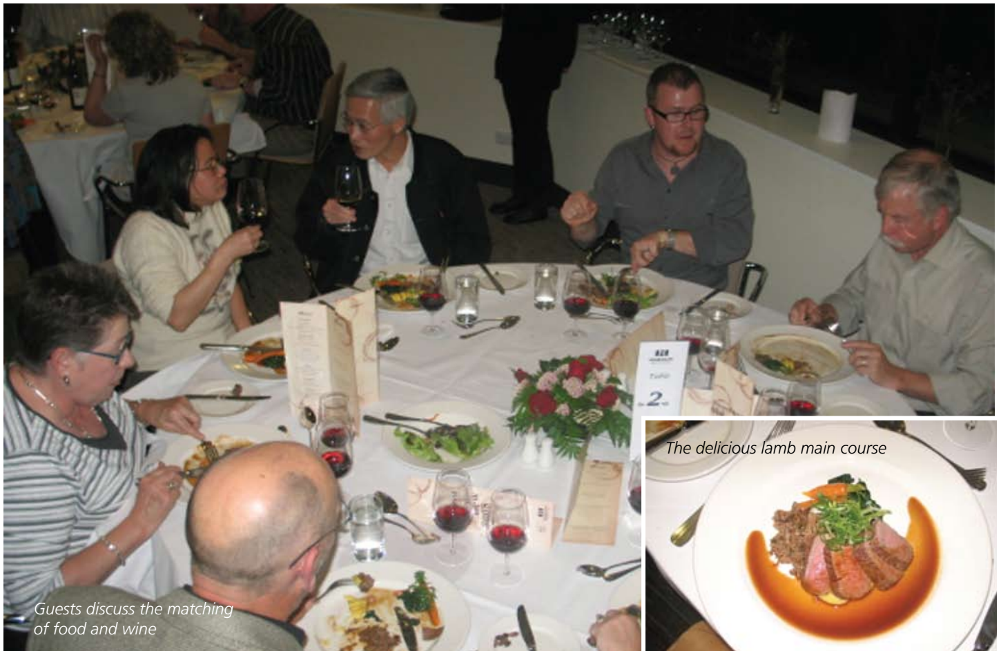
Guests discuss the matching of food and wine