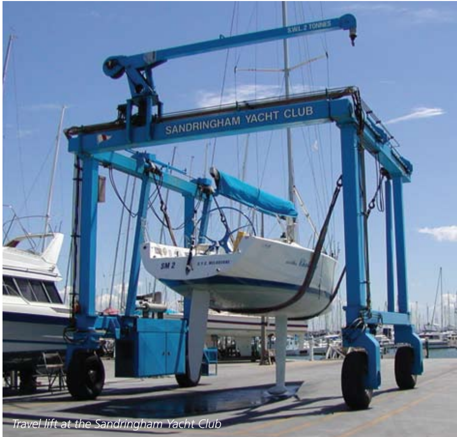
Travel lift at the Sandringham Yacht Club